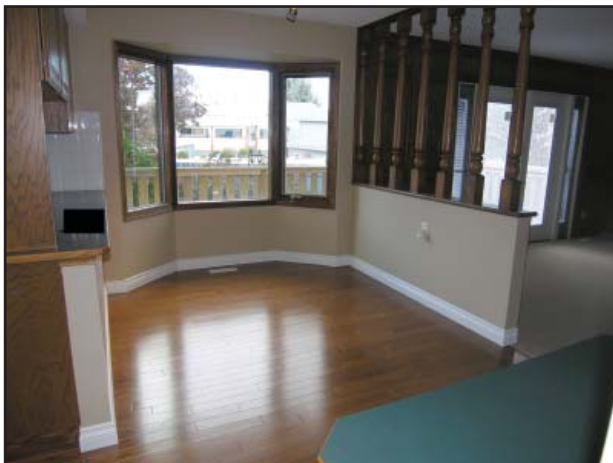
The gorgeous hardwood flooring newly installed and found in the kitchen and eating area.