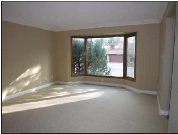
The formal living room to the front of the home has a large south facing bay window flooding this room with light.