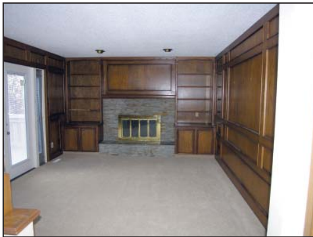
This room is brimming with a variety of focal points; the wood burning fireplace surrounded by thin slabs of stone, and built-in shelving on both sides.