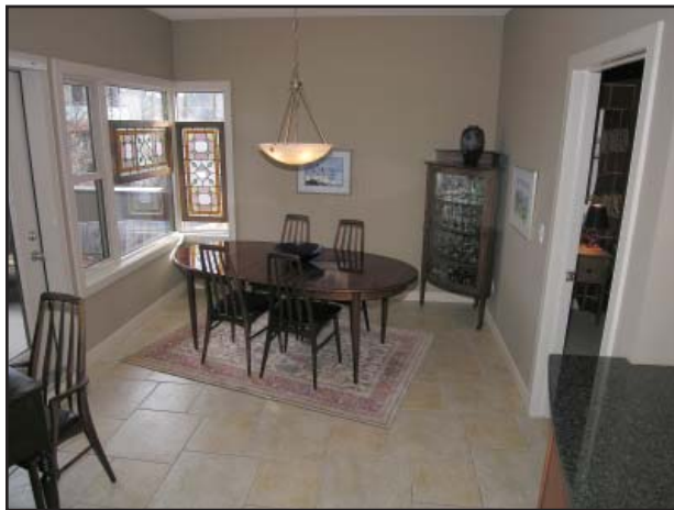
This condo has been designed in a Great-Room concept with all the rooms open to each other.