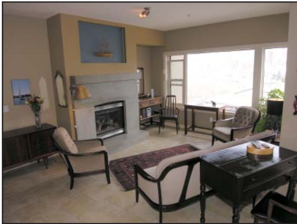
180 Degree unobstructed view of downtown from the living room, dining room and kitchen.