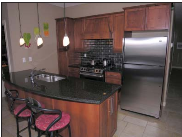
Designer inspired ultra modern kitchen with stainless steel appliance, a monochrome-look backsplash, an abundance of cabinetry and thick slabs of granite counters.