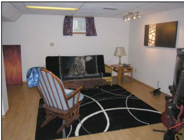
Fully finished lower level offering the fourth and fifth bedroom, spacious family room and 3-piece bath.