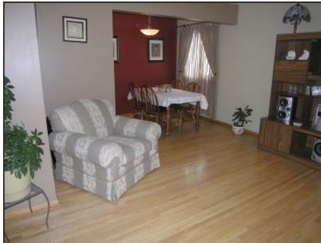
Living room and Dining room combination allow you to furnish with ease.