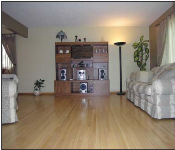
Gleaming hardwood floors, and a large South-facing picture window.