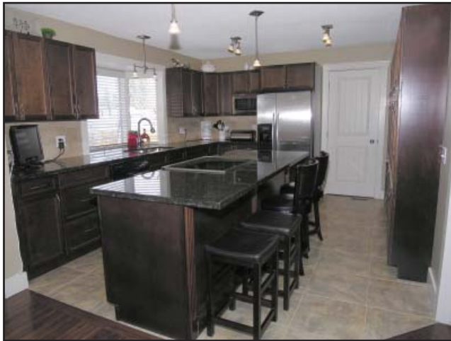
Gorgeous espresso stained cabinetry, stainless steel appliances, thick granite counters including the large island.