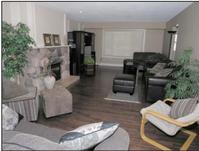
The size and spaciousness of this room, along with the fabulous windows at each end and the showpiece fireplace.